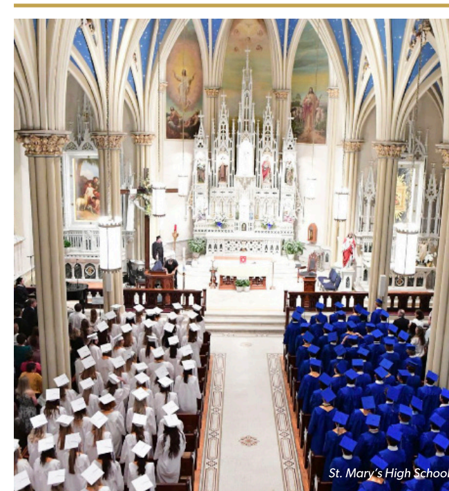
St. Mary's High School

In addition to the wide array of beneficiaries aided in ministry by Foundation distributions in FY24, more good news came in the form of eight new funds established by families and organizations with an interest in ensuring a thriving future for the funds' beneficiaries.